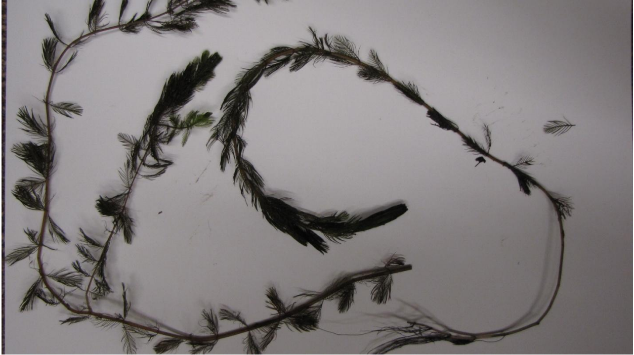
Figure 5. Pic IMG_0934. A specimen of Eurasian watermilfoil with roots from the channel between Circle Lake and Fox Lake sampled on 21 July 2010.