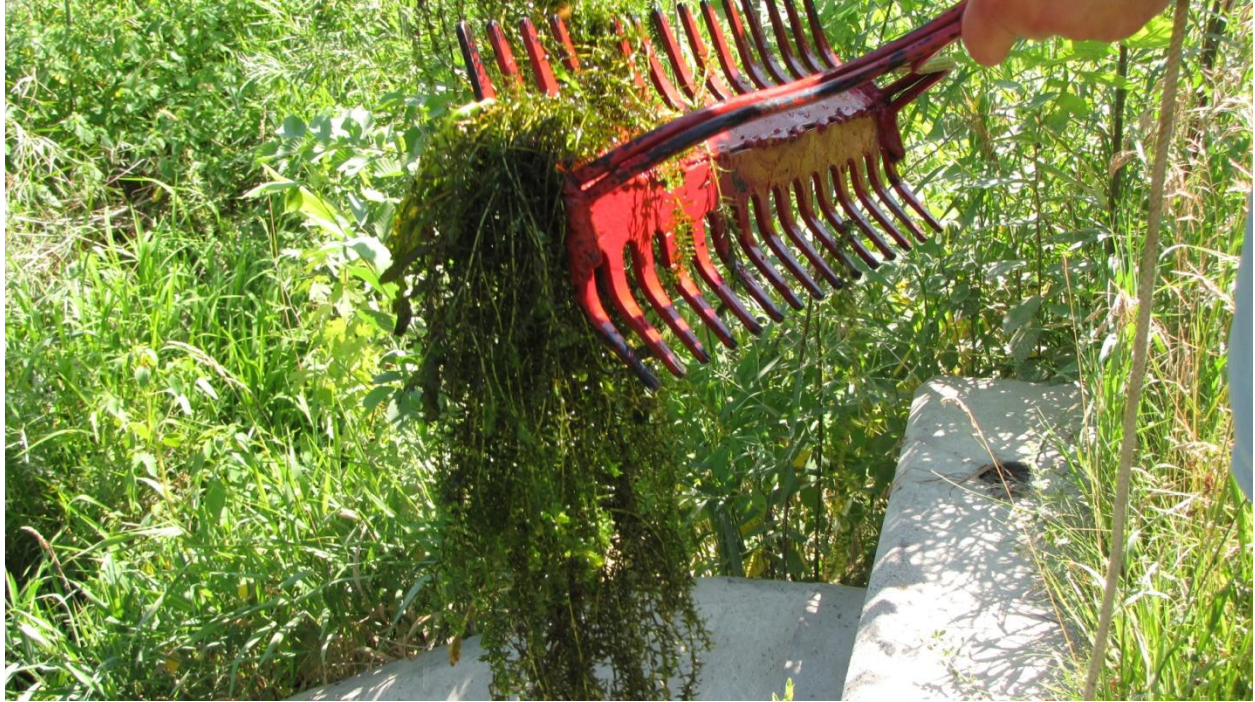
Figure 1. Pic IMG_0927. Sampling rake with elodea, curly-leaf pondweed, and Eurasian watermilfoil from the channel between Circle Lake and Fox Lake on 21 July 2010.