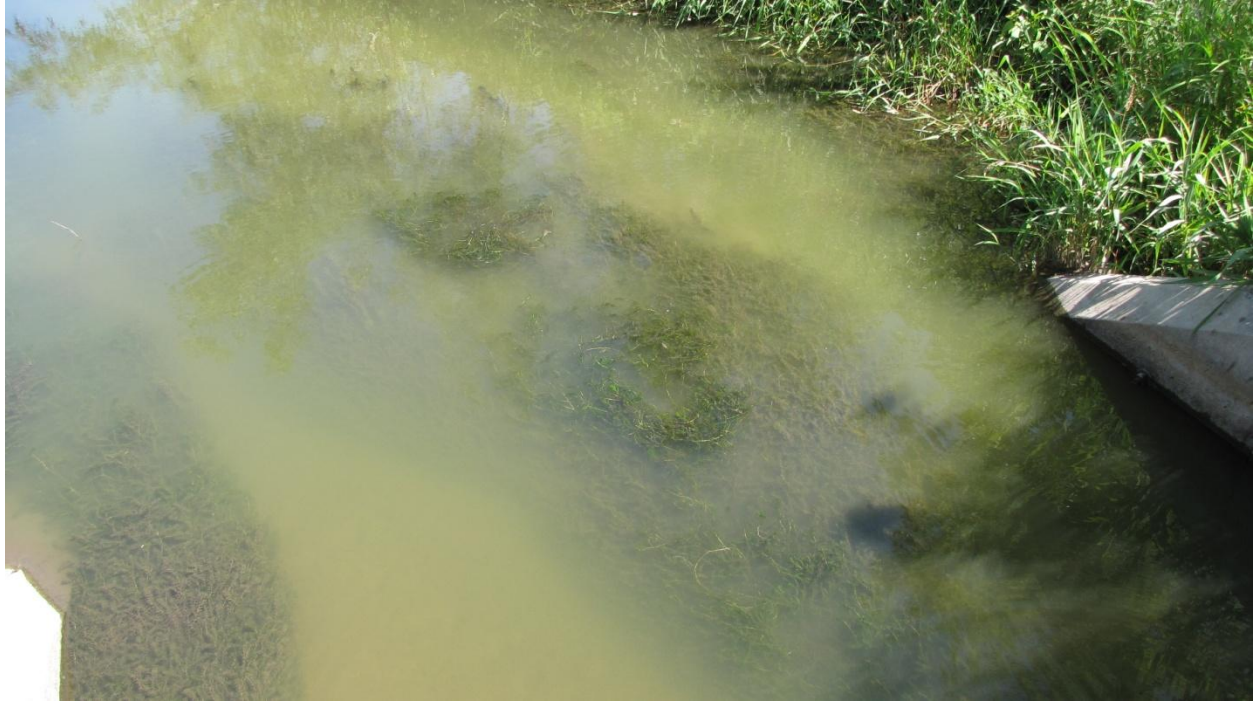
Figure 3. Pic IMG_0933. Area under the bridge near Circle Lake where rooted Eurasian watermilfoil is present.