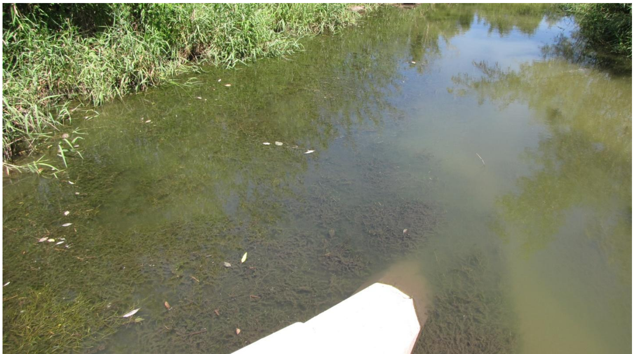
Figure 2. Pic IMG_0932. Area under the bridge near Circle Lake where rooted Eurasian watermilfoil is present.