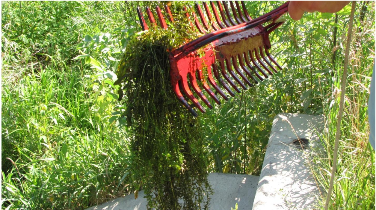
Figure 1. Pic IMG_0927. Sampling rake with elodea, curly-leaf pondweed, and Eurasian watermilfoil from the channel between Circle Lake and Fox Lake on 21 July 2010.