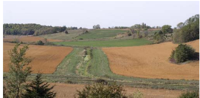
Filter Strip in Cannon City Township

Eligible applicants may include individual landowners, legal entities, and Indian tribes. The program will be offered to producers in all 50 states, District of Columbia and the Pacific and Caribbean areas through continuous sign-ups. Agricultural and forestry producers must submit applications by Sept. 30 to be considered for funding in the first ranking period. Congress capped the annual