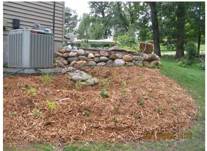
Raingarden installed in Faribault

If you are interested in learning more about raingardens please contact Danielle Waldschmidt at 507.332.5408 or Danielle.waldschmidt@mn.nacdn.net . Rice SWCD is looking for additional funds for landowners to install additional raingardens in Rice County.