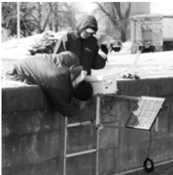
UCAP site install in Waterville, Spring 2009.

The goal of this project is to continue assessment of lakes and stream reaches in the Cannon River Watershed that need be assessed for impairments. This project collects water quality samples from 33 stream reaches and three lakes utilizing citizen stream volunteers and CRWP staff. A total of 430 water samples were collected with 2,430 corresponding water quality measurements recorded. Data collected from this project will be used by the MPCA as they develop the Impaired Waters 303(d) list. We anticipate a majority of the lakes and streams tested will be added to the list for excess nutrient and bacteria concentrations. In early January 2010, CRWP was notified that we will receive a third surface water assessment grant for 2010-2011 to continue surface water assessments in our watershed. I would like to thank all of our volunteers for their participation, we could not do this without you.