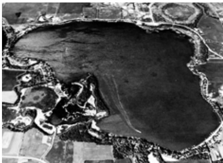
Aerial photo of Lake German

Map shows the City of Dakota (Winona County) and locations for a new sewer treatment site; site constraints include the Mississippi River, Amtrak rail line, Interstate 90 with on and off ramps, and the scenic bluffs.